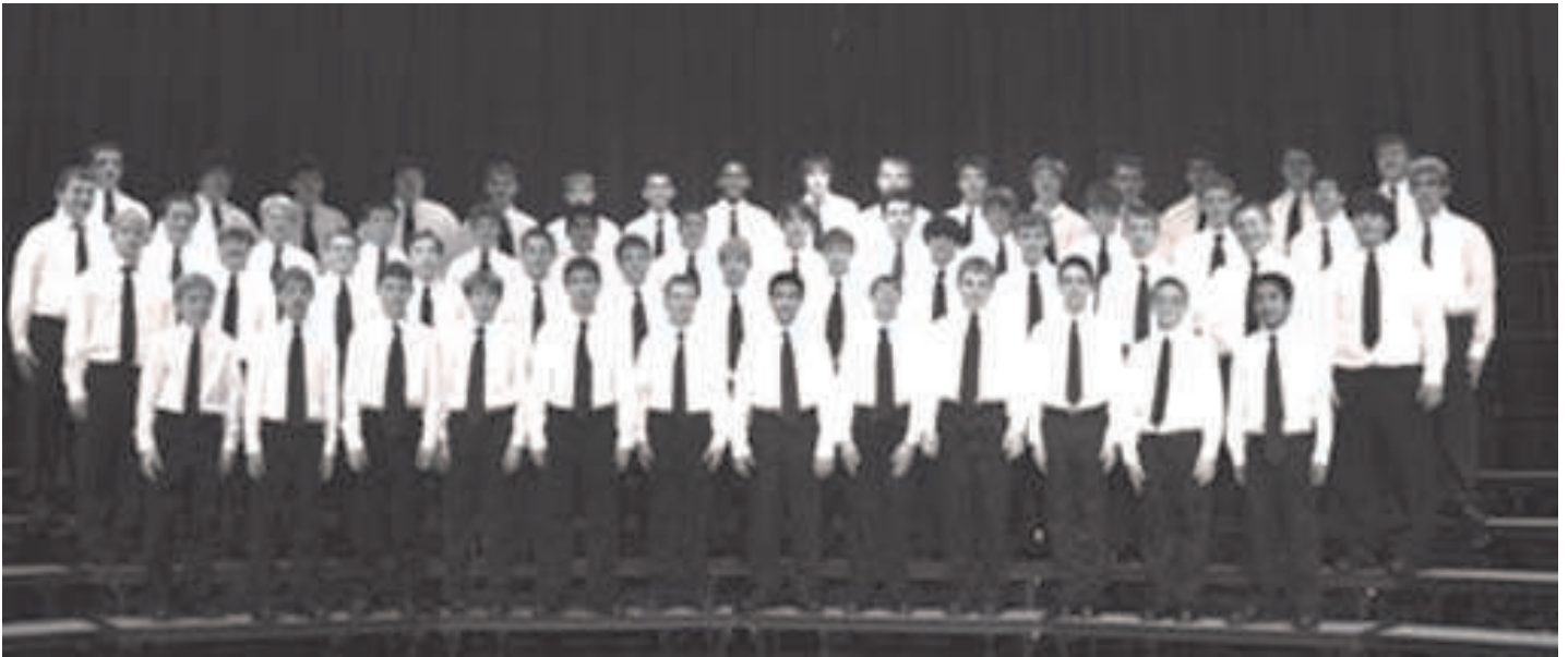
Nagel Middle School 8 th Grade Male Chorus

Don't miss out on all the excitement! See you at the JAD 2015 Spring Convention & Contest in Cincinnati, Ohio April 10 – 11, 2015.