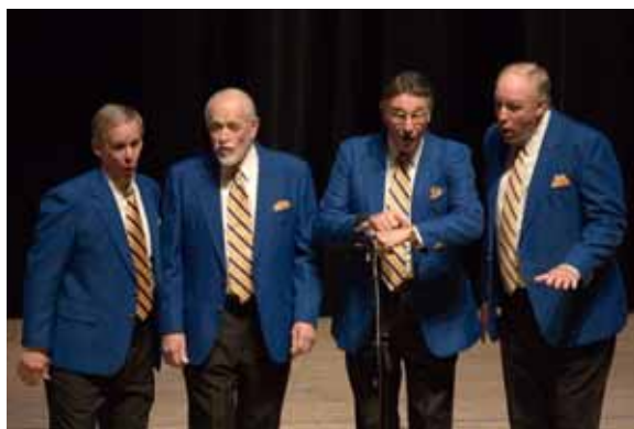
The Sunshine Committee