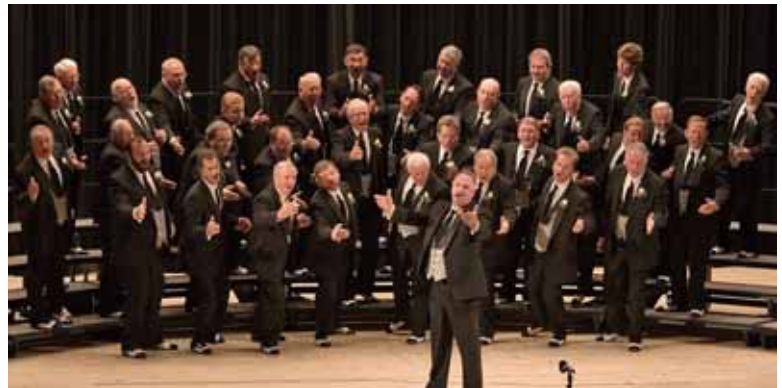
Penn Ohio Singers - Shenango Valley Chapter