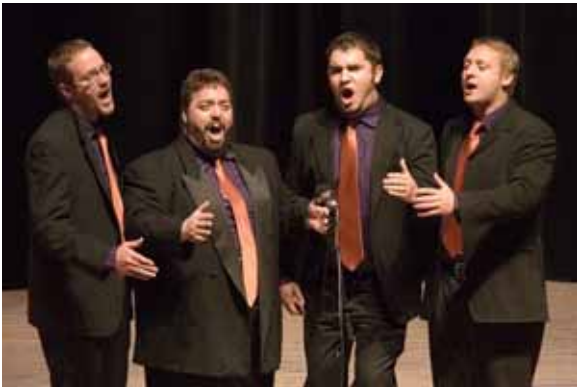
The Mulligan Brothers