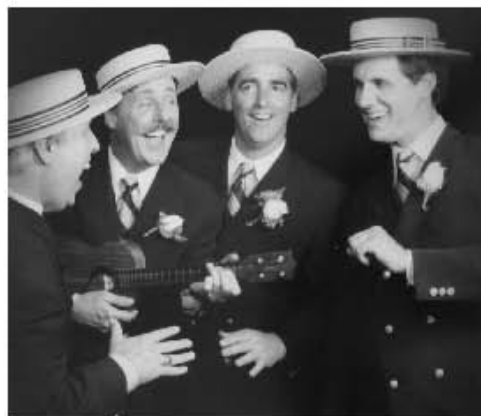
The Perfect Gentlemen – A Cappella Champions

Show Tickets - $22 Student & Group Rates Make Checks Payable to: Akron Chapter BHS PO Box 5434 Akron, Ohio 44334-0434 Forward order form, check and Self addressed stamped envelope* To the above address. *Without this, your order will be held at the box office, in your name. Ticket Information: 330-650-1535