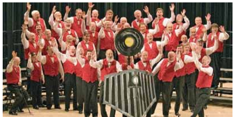
Akron Derbytownt Chorus - Akron Chapter