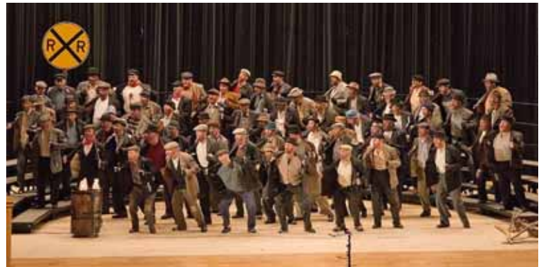
Singing Buckeyes - Buckeye-Columbus Chapter