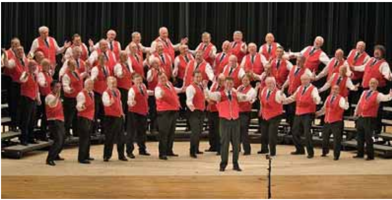
Delta Kings - Cincinnati Chapter