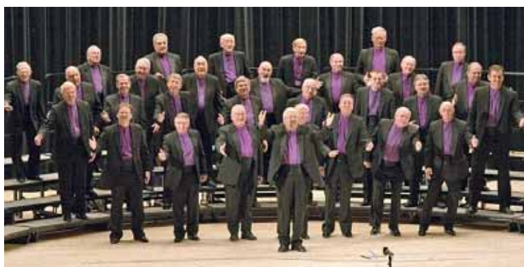
Melody Men - Miami-Shelby Chapter