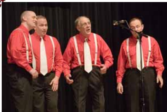
Thursday Night Forum