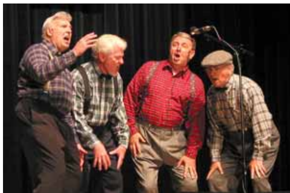
Test of Time