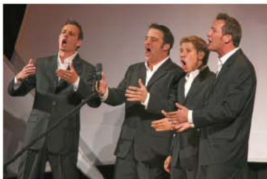
O.C. Times – International Bronze Medalist