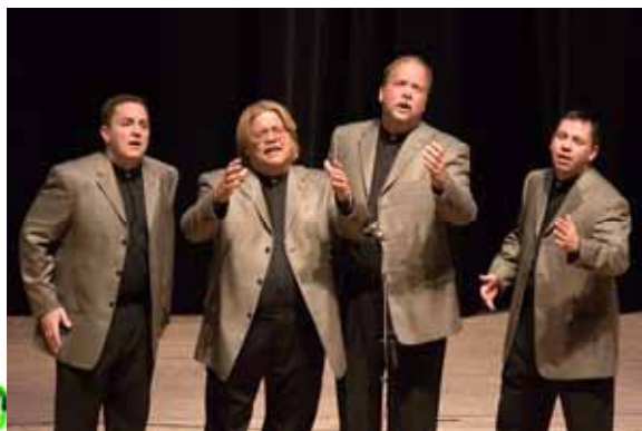
Chord Brewing Company