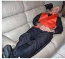
Singers Vest, choice of tie and pocket square, available in 27 brilliant colors $45

A black tux is a black tux on stage until you add the "pop" of our new "Singers Vest"