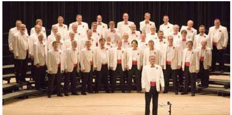
Northwesternaires - Defiance Chapter