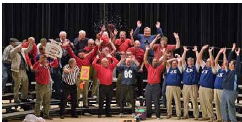
Fun Center Chordsmen - Mansfield Chapter