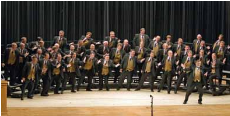
Voices in Harmony - Northwest Ohio Chapter