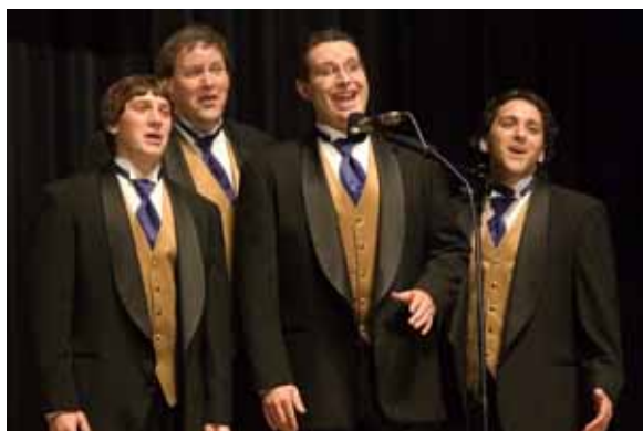
Parental Guidance Suggested