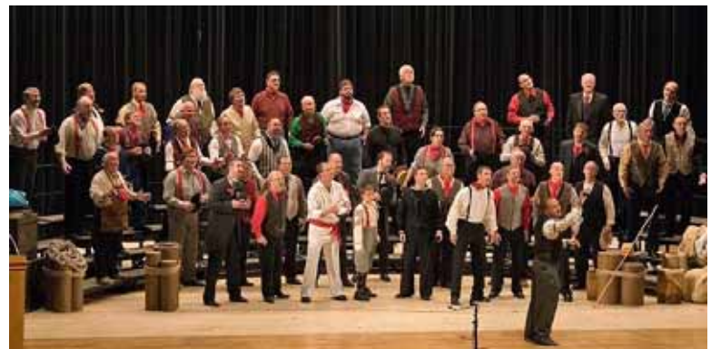
Men of Independence - Independence Chapter