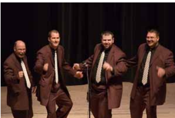
The Sound Connection