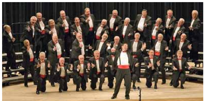
Hall of Fame Chorus - Canton Chapter