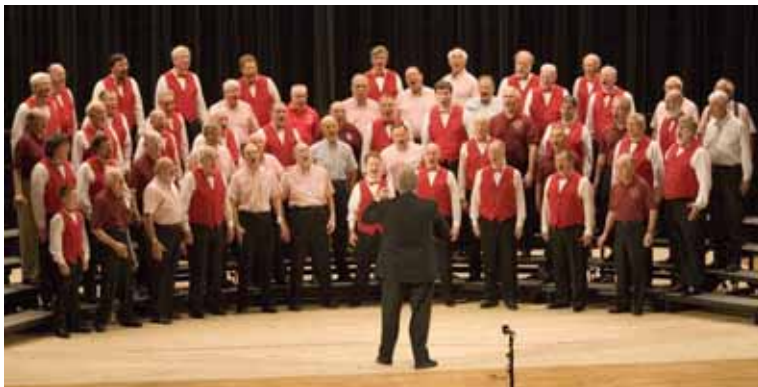
Mountainaires - Clarksburg-Fairmont Chapter