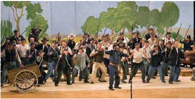
The Alliance - Greater Central Ohio Chapter