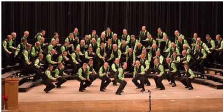
Southern Gateway - Western Hills Chapter