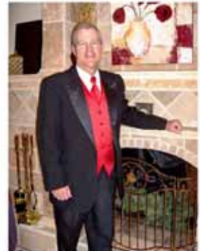
Singers Tux in black with shirt, Singers Vest and tie $160