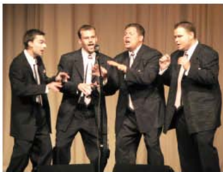
The Allies – 2006 District Gold Medalist