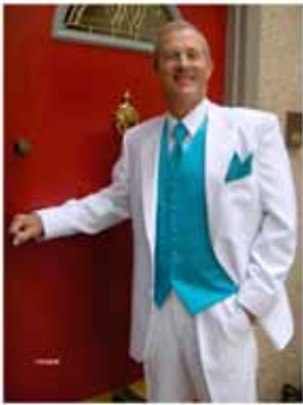
Singers Tux in all white or white/black with shirt, Singers Vest and tie $188