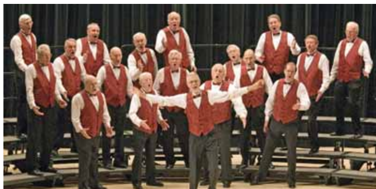
The Steel City Harmonizers - Pittsburgh Metro Chapter