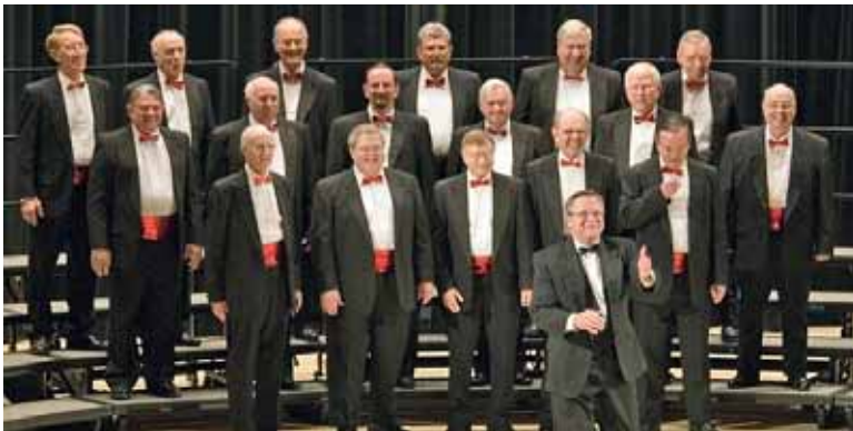
Heart of Ohio - Heart of Ohio-Columbus Chapter