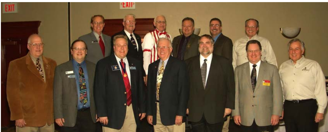
2005 JAD Leadership Team Assembled

won't ask for more. On the other hand, if he gets no help or support from the general membership, a malaise can fall upon him pretty quickly. Let's not let that happen in this district. One of the many benefits we enjoy by being members of the Barbershop Harmony Society is education. Not only in our performance arts, but in our management skills. Attending COTS is just one of those opportunities and the returns are so great. Not only do we receive instruction that is supposedly proven and approved by the Society, but in a larger sense, we get to network with the guys in the trenches. Nearly all these fellows who attend COTS have been there before, either in the same office or a different one in their respective chapters. These are the real movers and shakers in our society, the guys in the trenches, and the ones who really make it happen. And they are willing to share. COTS is open to all and a legitimate Chapter expense. Registration includes