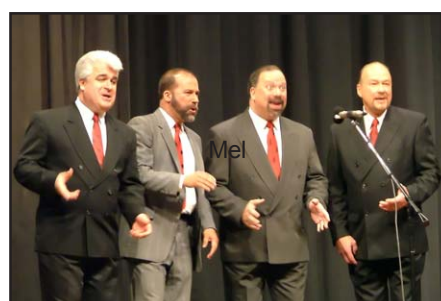
7- Quad Pro Quo