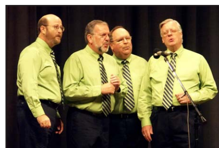
13 - Majestic Sound