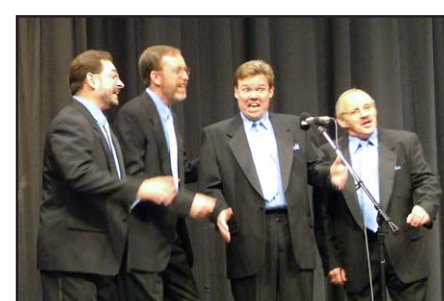
8 - Rhythm 'n' Rhyme