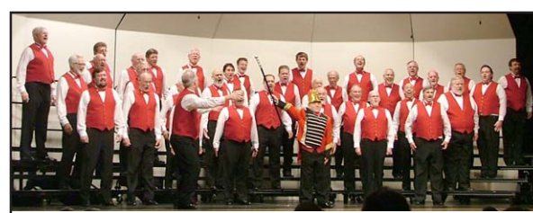
Akron - Derbytoun Chorus