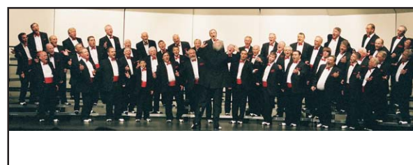
Mansfield - Fun Center Chordsmen