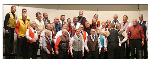
Independence - Men of Independence