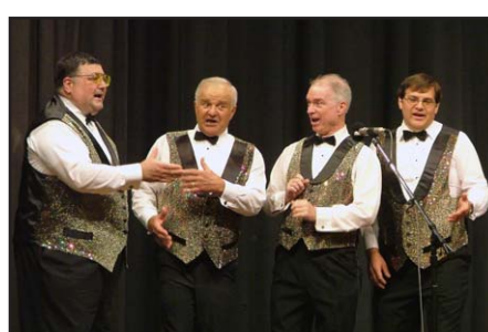
3 - Lorain Four