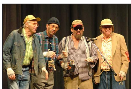
5- Indy Gents