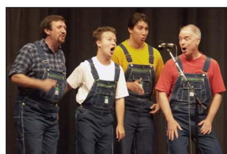
21 - Derbytown Sound