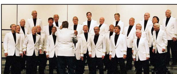
Maumee Valley - The Seaway Commanders