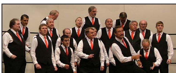
Eastern Cabel County - ThunderTones