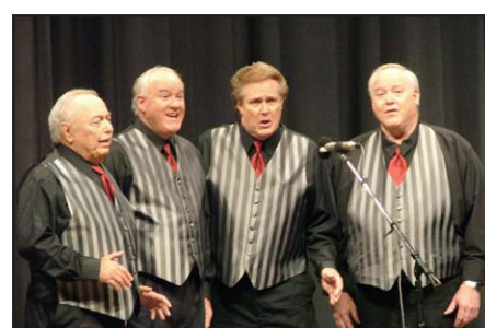
9 - Three and 1/2