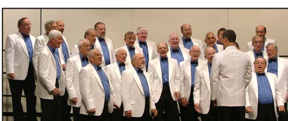
Cleveland West - Tower City Chorus