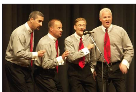
18 - The News