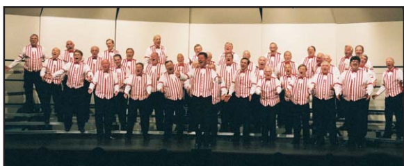
Cincinnati Delta Kings