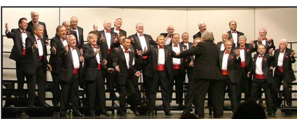
Clarksburg-Fairmont - Mountaineers