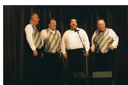
Mic Tester #1