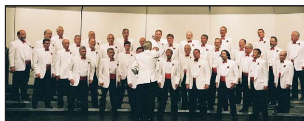
Defiance - Northwesterners