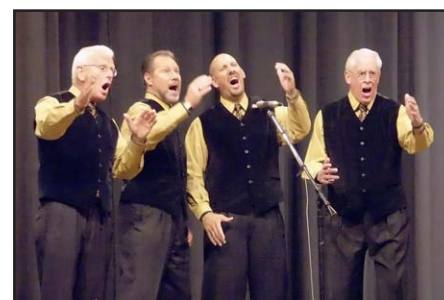
16 - Montage