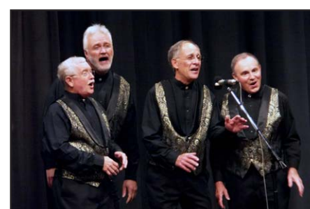
12 - Sudden Impact