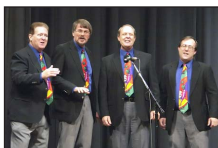
23 - Achordance