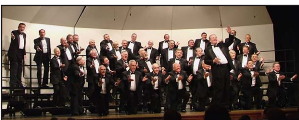
Canton - Hall of Fame Chorus