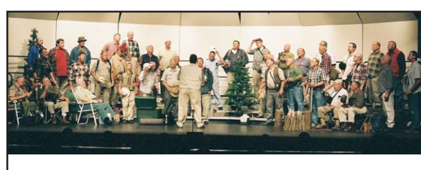
Zanesville - Y-City Chorus