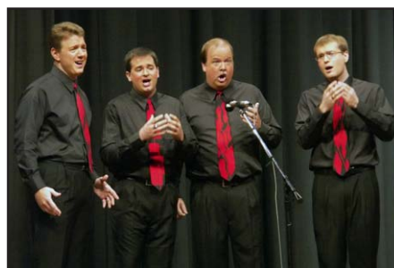
15 - APB