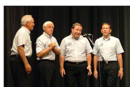
Eastern Division Mic Tester Sound Advantage