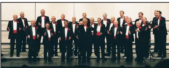
Miami-Shelby - Melody Men