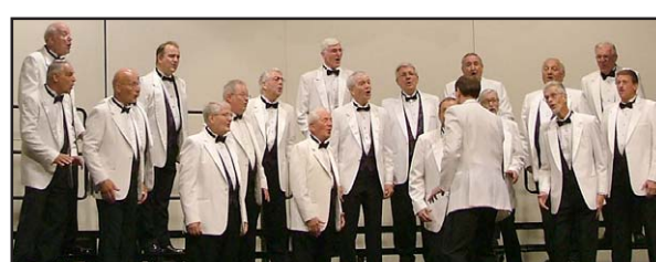
Pittsburgh Metro - Steel City Harmonizers