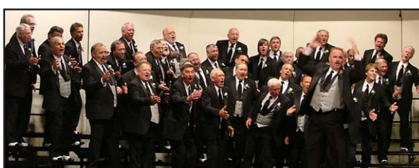
Shenango Valley - Penn Ohio Singers