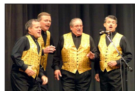
4- Harmony Supply Line