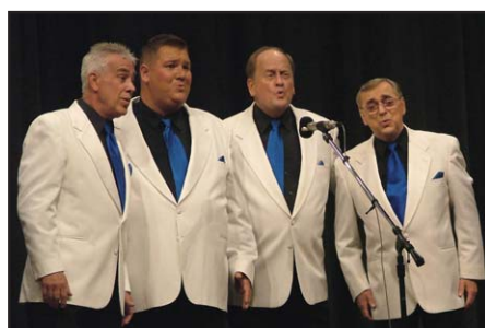
14 - Twilight