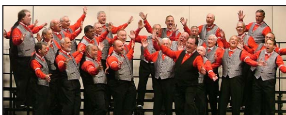
Greater Kanawha Valley - Kanawha Kordsmen