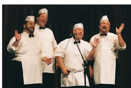
17-Hot Air Buffoons