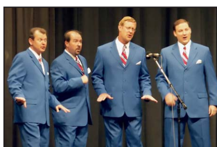
11 - The Remedy