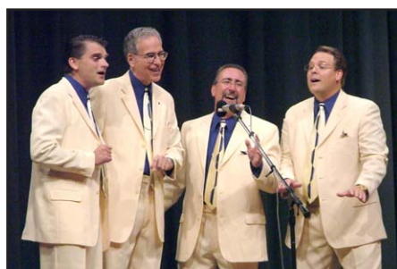
6 - Crushed Velvet