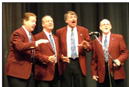
1 - Keyed Up

Cider Press Quartet Contest