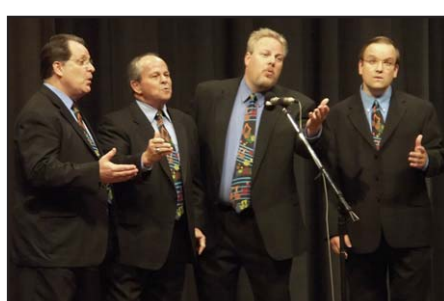
22 - The Boardmen