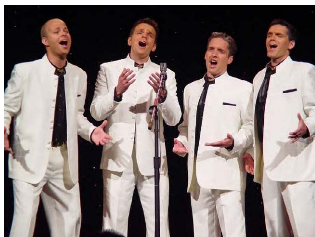
Realtime – 2005 International Champion