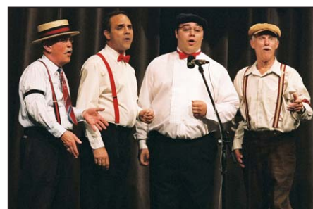
14-By Mutual Agreement