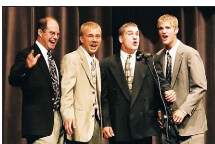
9-State Route 111