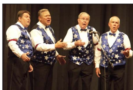
19 - The Four Chordsmen