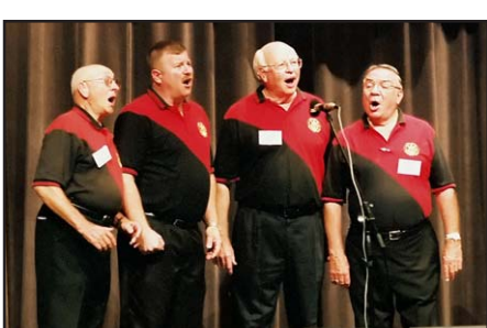
Mic Tester #2