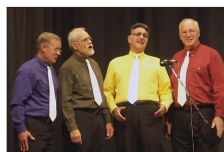
24 - The Sunshine Committee