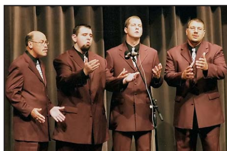
2-The Sound Connection