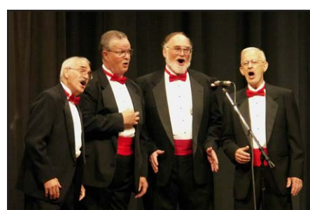
17 - Picture This