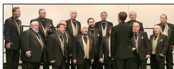
Elyria - Cascade Chordsmen