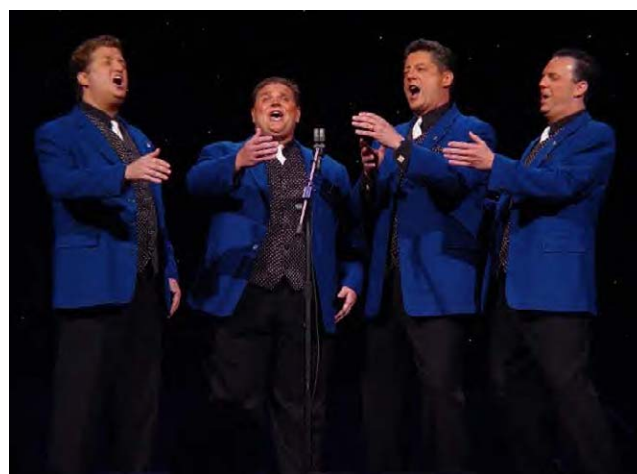
MaxQ – 2005 International Silver Medalist