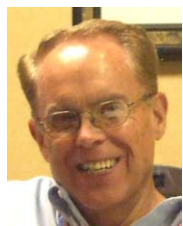
By: R.F. Miller - JAD DVP M&PR

The public relations function within a chapter is both an internal and external activity. The internal public relations involve keeping the chapter members aware of the activities of the chapter and creating a positive attitude within the chapter. A chapter bulletin is a great way of communicating with the membership. If your chapter has a bulletin or newsletter, use it to create a good internal image of the chorus. A well-informed, positive thinking member is more likely to create a good external image of the chapter when he talks with others.