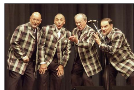
20 - Phoenix