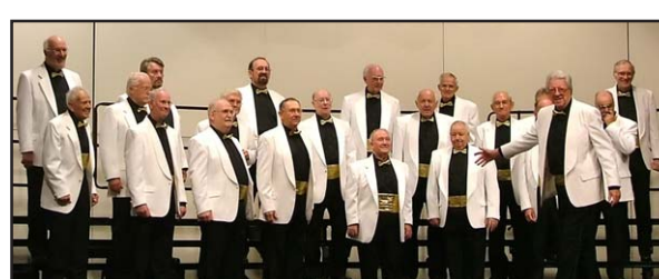
Beaver Valley - King Beaver Chorus