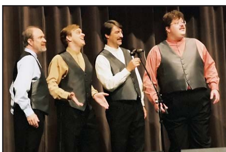
5- Key Signature