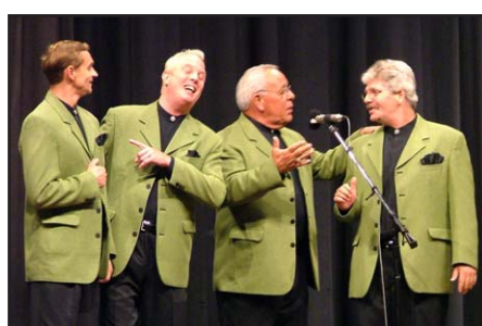
10 - Accent