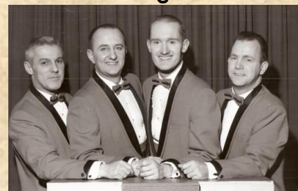
Town and Country Four