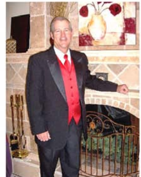
Singers Tux in black with shirt, Singers Vest and tie $160