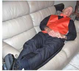
Singers Vest, choice of tie and pocket square, available in 27 brilliant colors $45

A black tux is a black tux on stage until you add the "pop" of our new "Singers Vest"