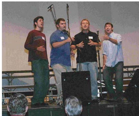
Four Way Stop Impresses the Students

and afterward we were asked to perform for them. The kids made us old guys feel like rock stars, they were so excited and supportive. Truly, we are looking forward to next year's clinic/workshop. We are hoping to garner a larger grant to have an even bigger program. (Notice I didn't say better -- How could it be?) 🎵