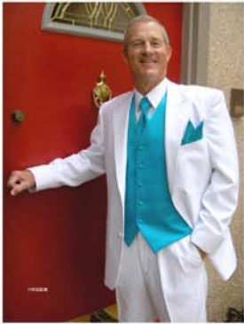
Singers Tux in all white or white/black with shirt, Singers Vest and tie $188