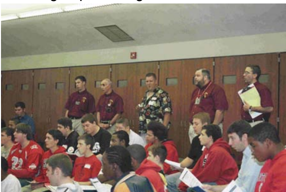
Hall of Fame men sing with the students.