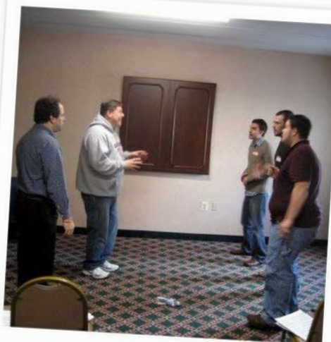
The Allies & Raymond Schwarzkopf