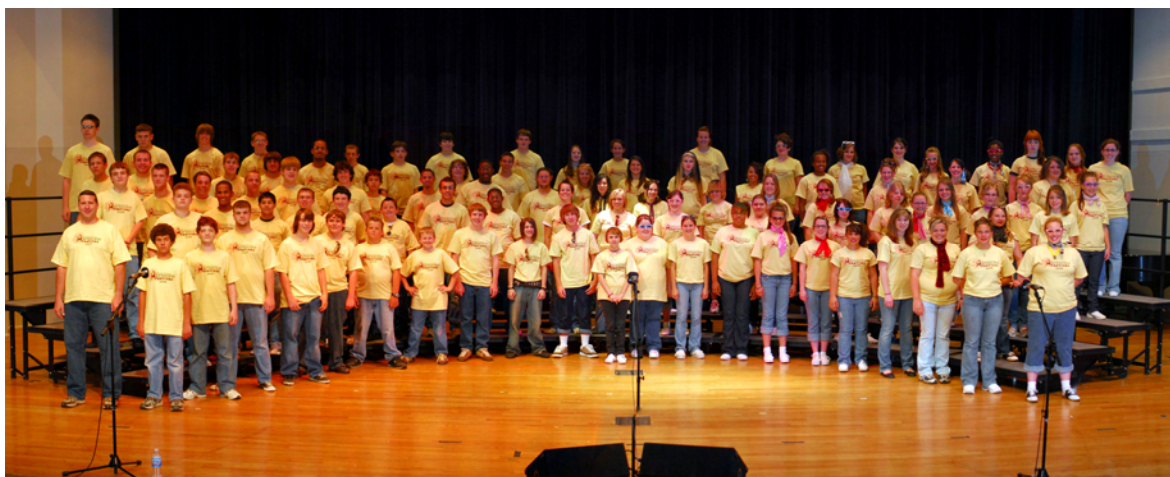
The Harmony Festival Girls Chorus performs with Nick Gordon, a member of the award-winning barbershop quartet Prestige, during the 2008 Harmony Festival finale performance.

The 3rd annual Greater Cincinnati Harmony Festival’s key local sponsors are National City and Applebee’s. 🎵