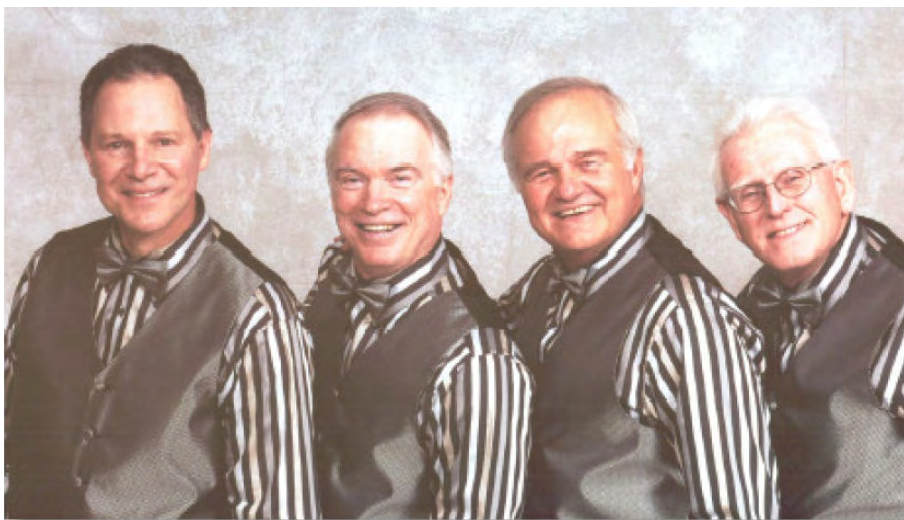
OVER EASY - 2008 JAD Senior Quartet Champions

This wonderful group of singers (approximately 30-35) along with a chapter quartet, Domino Effect , entertained the audience for approximately forty five minutes, singing true Barbershop Harmony very BEAUTIFULLY. After hearing them sing you knew immediately why they invited to Lakeside, to totally entertain and that they did with MAGNIFI-