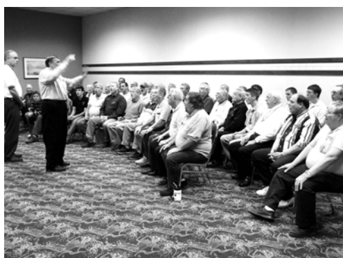
R.D. working with Y-City Chorus