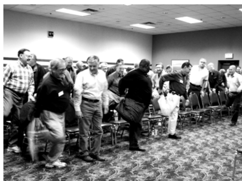
Director's warm-up, crane style