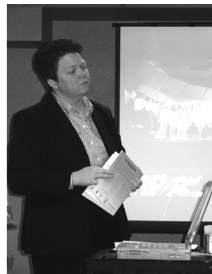
Troy District Administrator praises Miami-Shelby

been avoided, had their chapter officers complied with the published rules.