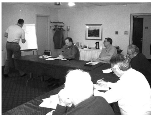
Membership Summit in Sidney