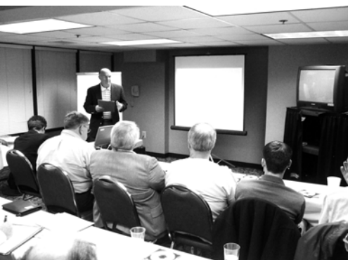
Youth Outreach seminar learns of Miami-Shelby success story