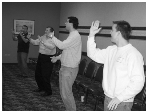
R.D. &amp; experts in action