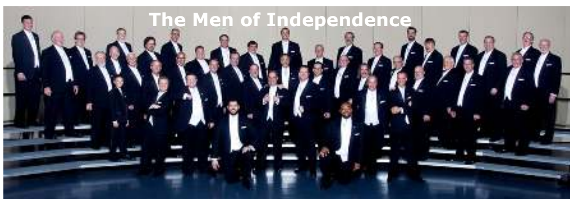
Independence, OH Chapter