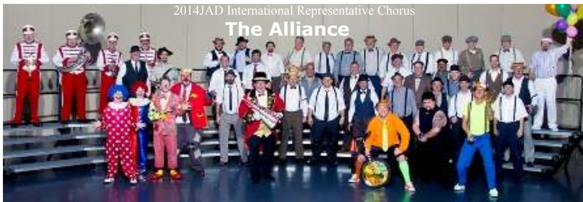
Greater Central Ohio Chapter