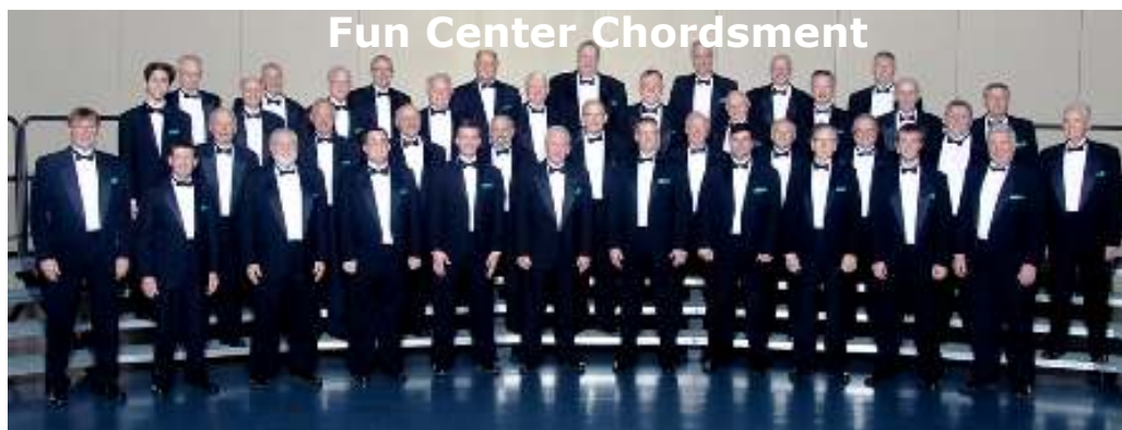
Mansfield Ohio Chapter