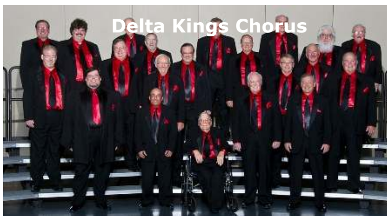
Cincinnati Ohio Chapter