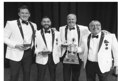
Speakeasy - 2017