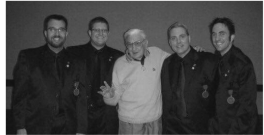
Cadillac Jack - 2008