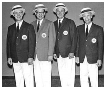
The Blazers - 1963