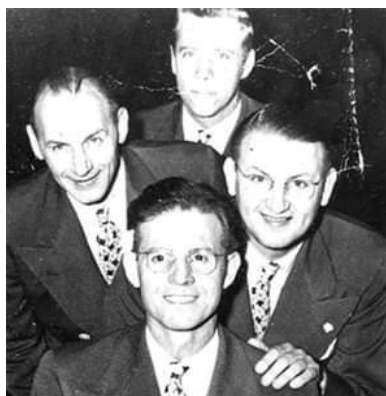
Jolly Fellows - 1948