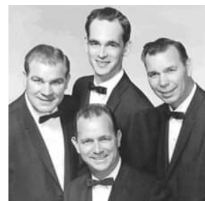
Point Four - 1968