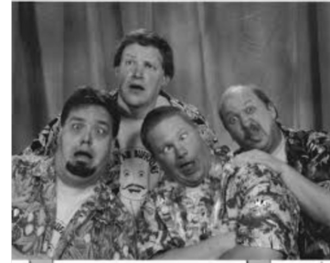
Hot Air Buffoons - 2005

Judges in this category evaluate the degree to which the performer achieves artistic singing in the barbershop style: the production of vibrant, rich, resonant, technically accurate, and highly skilled sound, created both by the individual singer's use of good vocal techniques, and by the ensemble processes of tuning, balancing, unity of sound and precision. They listen for a sense of precise intonation, a feeling of fullness or expansion of sound, a perception of a high degree of vocal skill, a high level of unity and consistency throughout the performance, and a freedom from apparent effort that allows the full communication of the lyric and song.