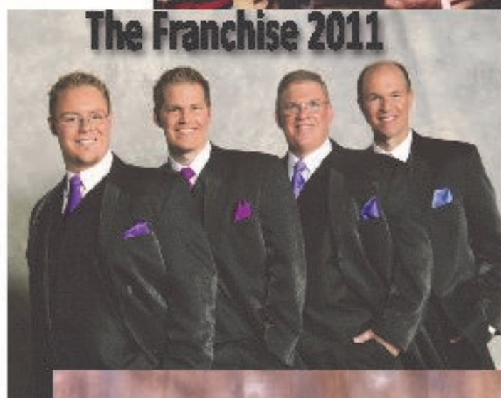
The Franchise 2011