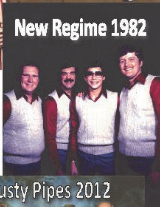
New Regime 1982