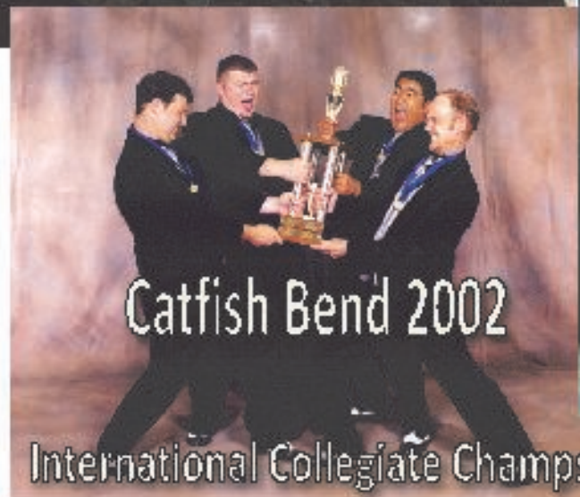
Catfish Bend 2002