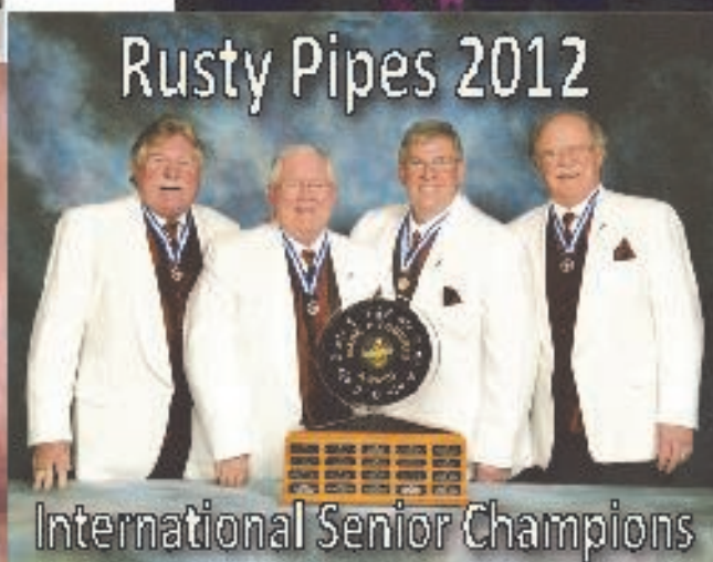
Rusty Pipes 2012