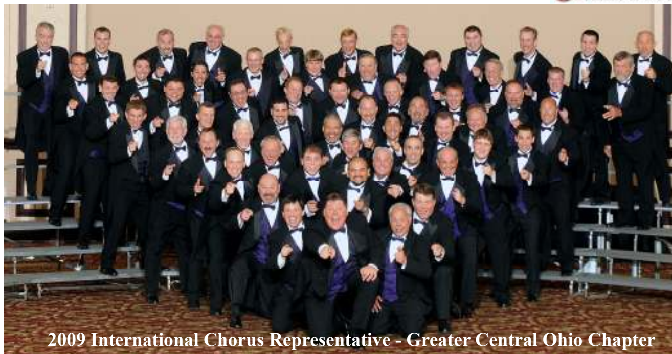
2009 International Chorus Representative - Greater Central Ohio Chapter